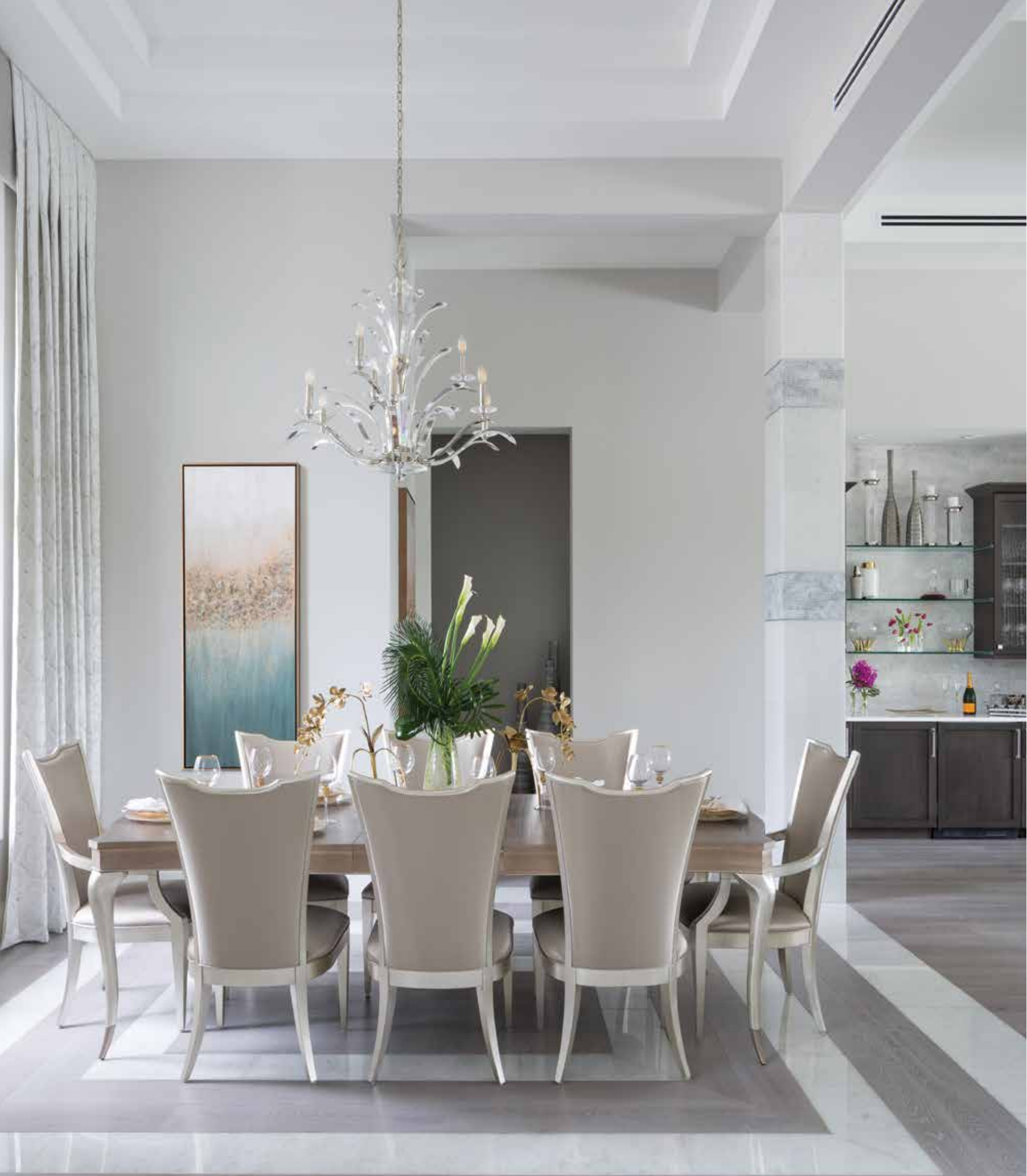
Left: This regal dining set showing off metallic champagne wood finishes, gold inlay, and gold linen fabric prominently sits below the crystal chandelier. Stone banding on the column attracts the eye upwards, much like the icy white, flat-fold, waterfall draperies from Dwayne Bergmann Interiors. Splashing creamy topaz, gleaming gold, bold turquoise, and silvery-white colors, this oil-on-canvas artwork elegantly traverses the colorway and glamorous Florida setting.