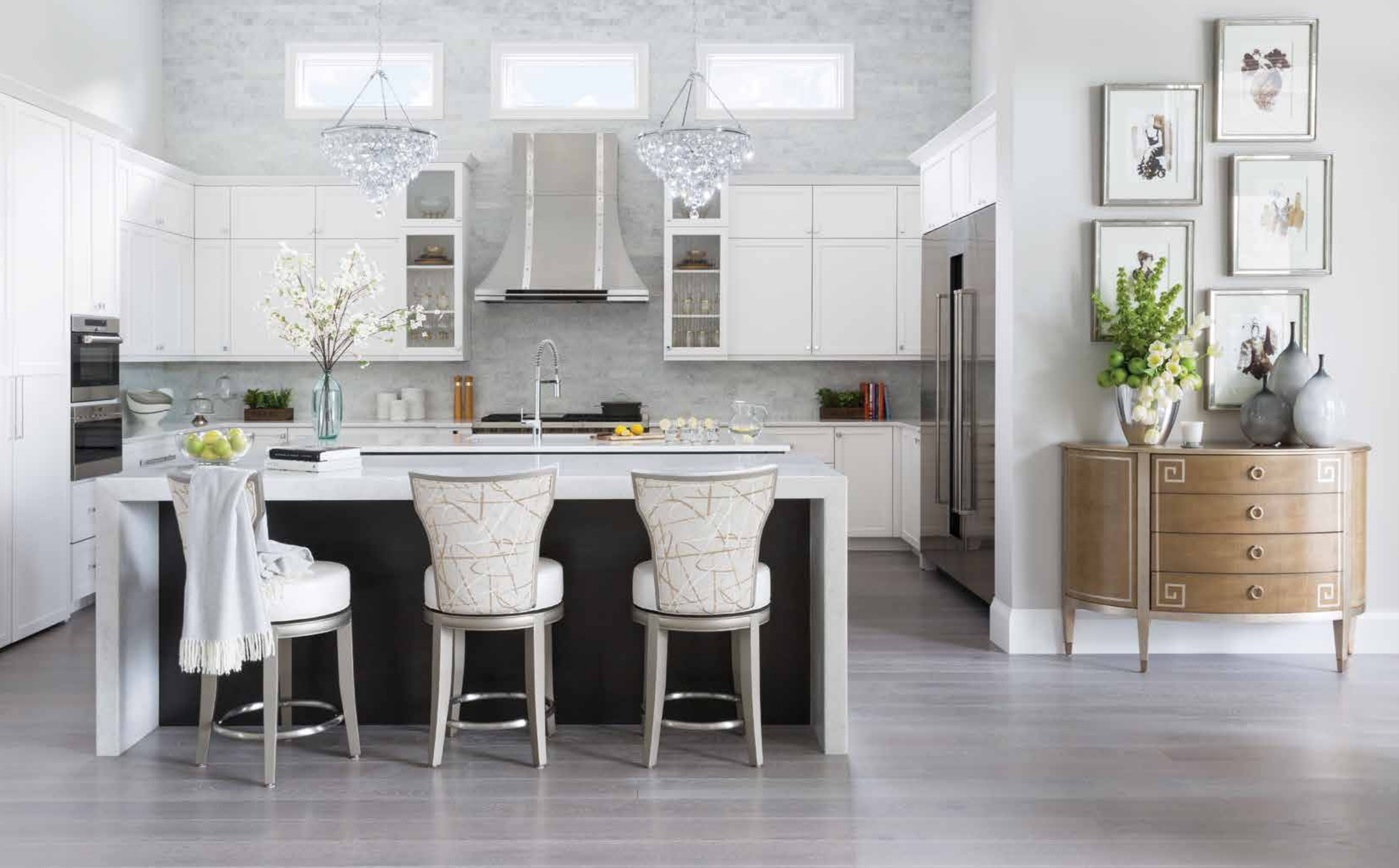
Above: Light cascades through the clerestory windows, reflecting off the glitzy chrome and crystal chandeliers and the faucet from Ferguson Bath, Kitchen & Lighting Gallery. Feminine curves and faux ostrich leather barstools balance the deeper masculine tones of the island. The sideboard, with vintage details in a metallic champagne beige, anchors the watercolor fashionista portraits dressed in antique mirrored frames from Dwayne Bergmann Interiors, and Legno Bastone Wide Plank Flooring below is from their LaFlamiglia collection in the Domenico finish.

With 14-foot ceilings, the great room showcases an opulent chandelier that embodies the grace of a jewel-clad fashionista. Alongside it is the mixed material floor-to-ceiling fireplace — a signature of the Hollywood-glam style. Low profile furnishings, arranged for conversation, with gentle curves and a soothing color palette soften the lines of the structure.