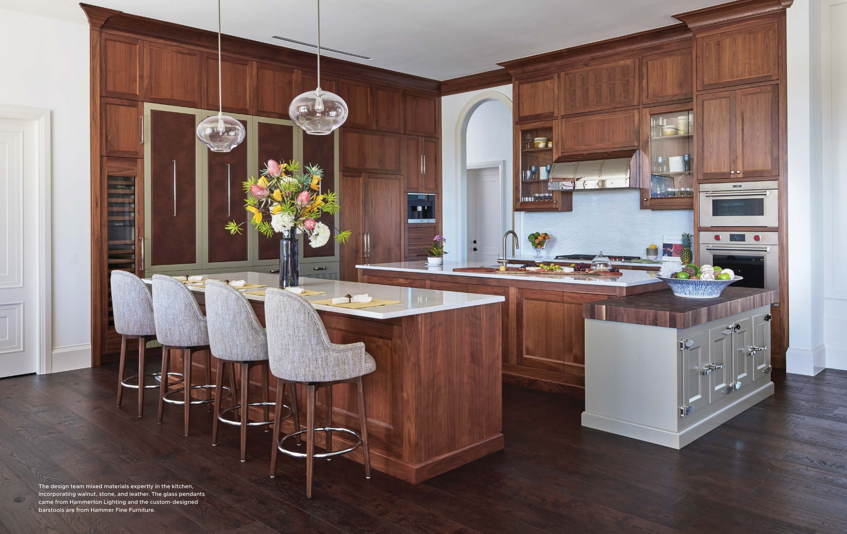
The design team mixed materials expertly in the kitchen, incorporating walnut, stone, and leather. The glass pendants came from Hammerton Lighting and the custom-designed barstools are from Hammer Fine Furniture.

“Scale was a crucial point in all our discussions,” says interior designer Dwayne Bergmann. “The key question was: How do we make these large areas feel comfortable and less overwhelming?”