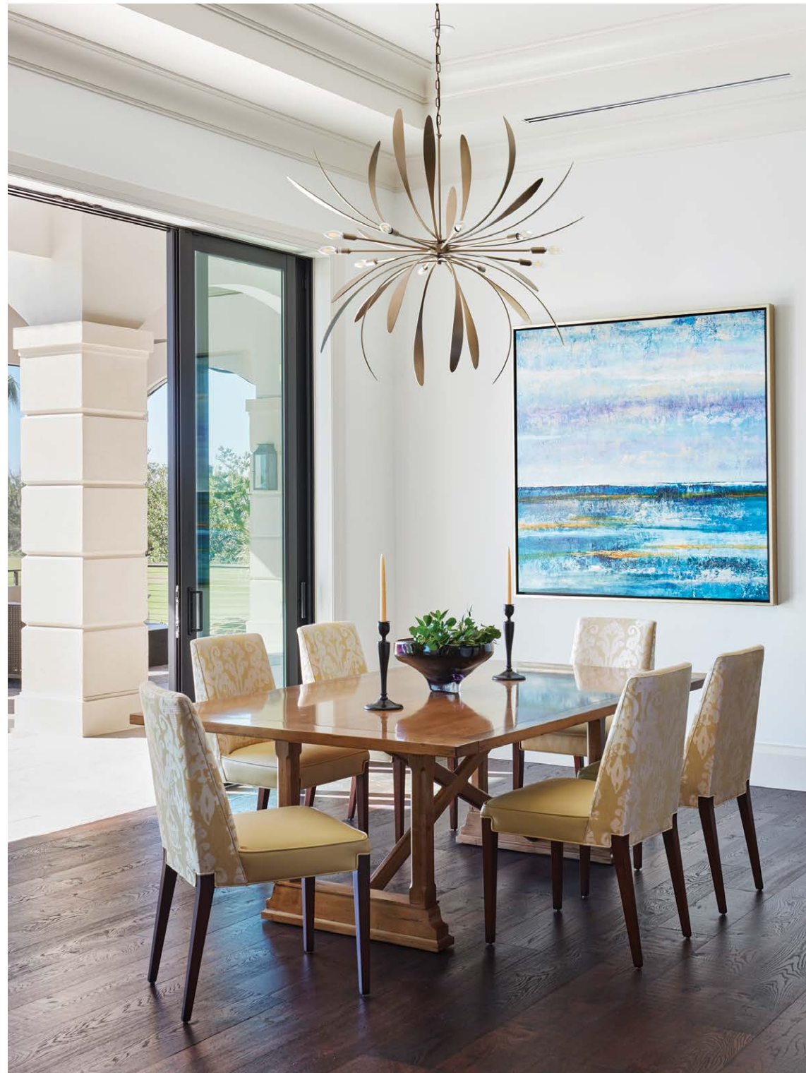
LEFT: A Hubbardton Forge light fixture hangs over a Chaddock table and upholstered Theodore Alexander chairs in the formal dining room.