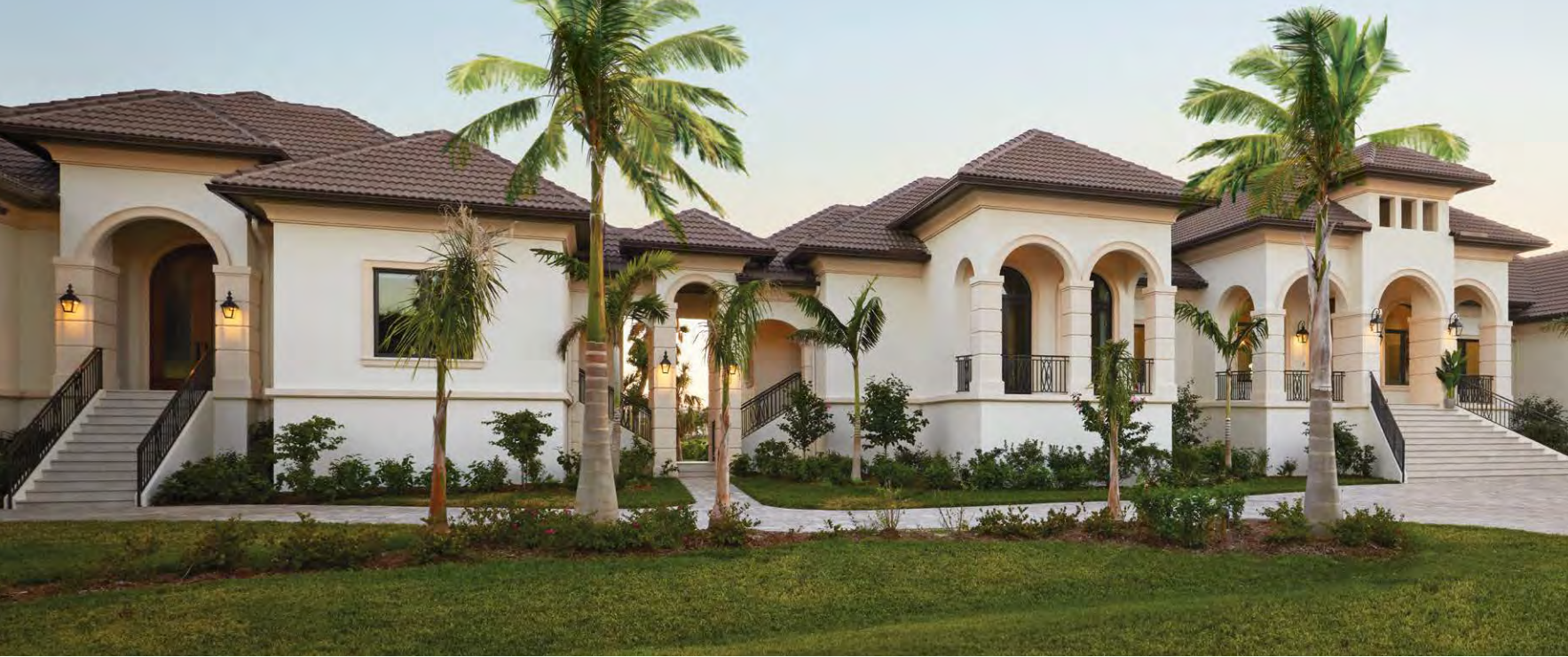
ABOVE: Architects from WAJ Design Services worked with MAB Homes to create this Sanibel Island residence, which stretches across two lots. A portico connects the 4,300-square-foot main house and 2,100-square-foot guest house.