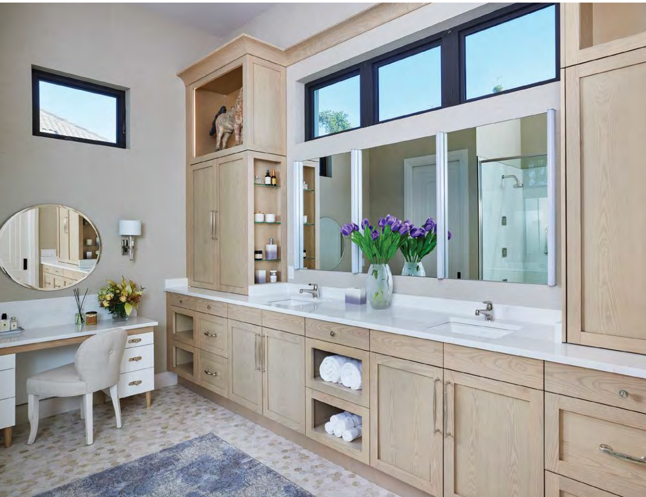
ABOVE: The sinks in the primary bathroom are higher than standard to accommodate the husband's height, while a standard-height vanity was customized to the wife. Dwayne Bergmann Interiors designed and fabricated the oak cabinets and vanity.