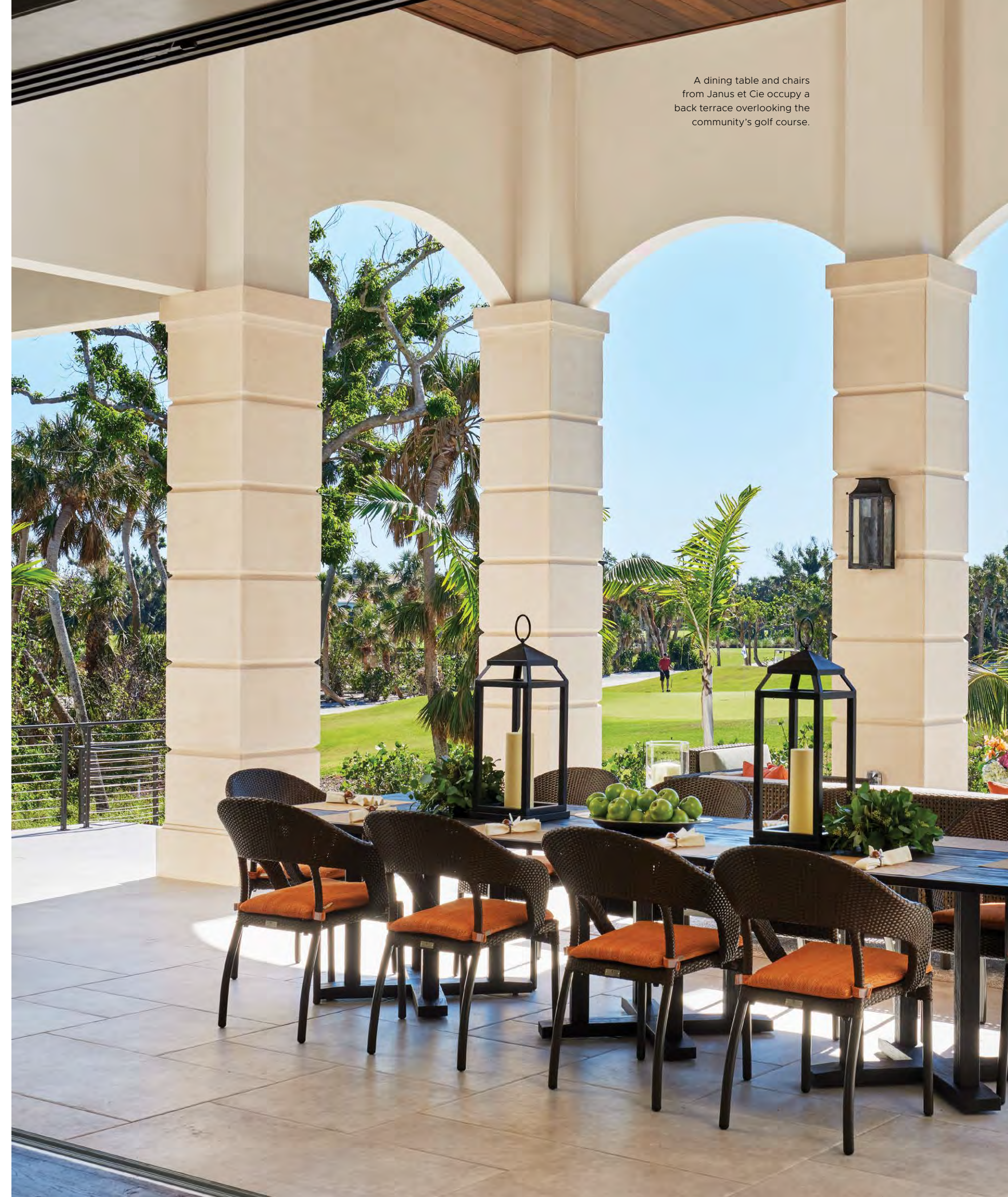
A dining table and chairs from Janus et Cie occupy a back terrace overlooking the community's golf course.