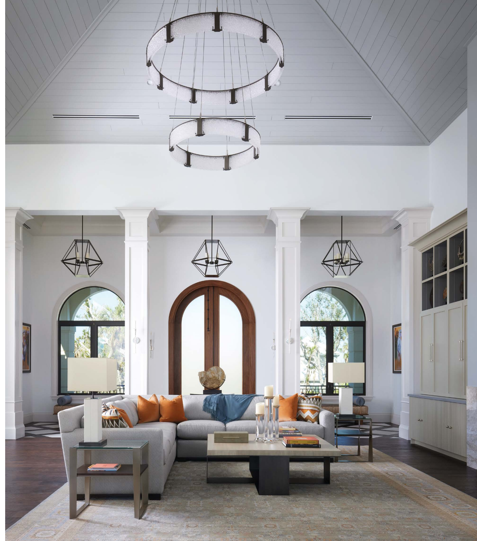
RIGHT: The living room's grand feel is balanced with design that welcomes conviviality. Close inspection reveals details like natural stone in a diamond pattern on the foyer floor.

“Scale was a crucial point in all our discussions,” says Bergmann. “The key question was: How do we make these large areas feel comfortable and less overwhelming?”